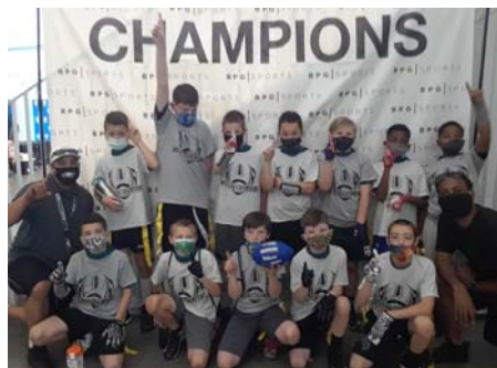
Delaware Flag Football , Director Operations