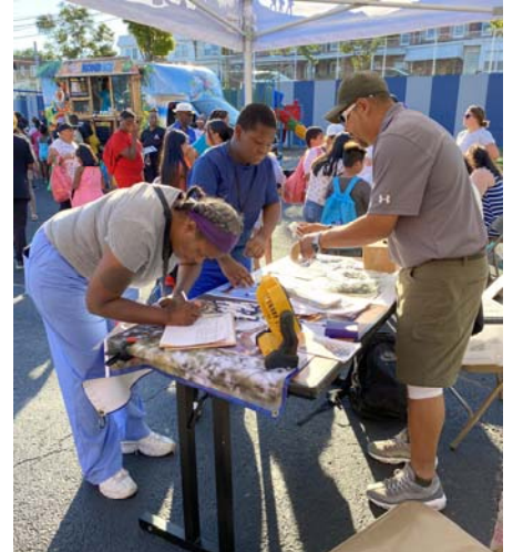
Scout recruiting table at People's Festival

into the exploits that got me into trouble as a kid."