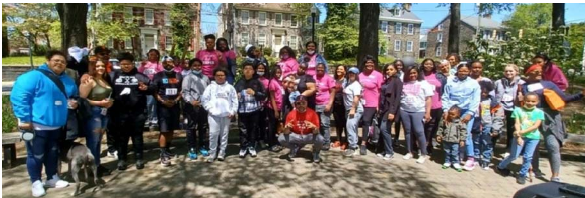
Athletic Director at Girl's Inc.